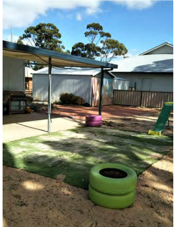
Right: After the turf had been laid, creating a comfortable spot for the children to play on.