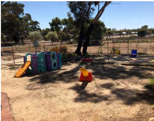
Left: Before the turf.