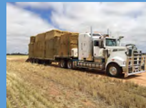
Milnthorpe Farm Machinery Hire

11 Trucks 3 Front End Loaders 1 Grader 1 Roller 1 Bobcat 67 loads of sand 2479km distance carted 1129 tonne of sand delivered 32 Volunteers 4 Hours Start to Finish Over 100 Volunteer Hours donated Estimated Value Donations $15K