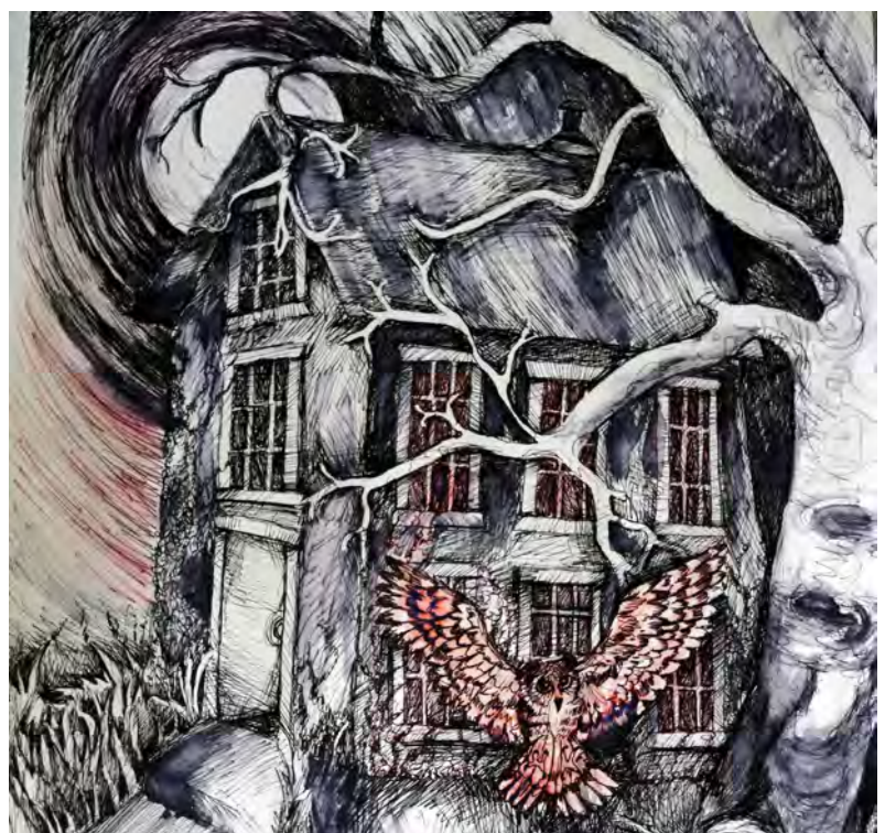
Below: An example of Leanne's work.