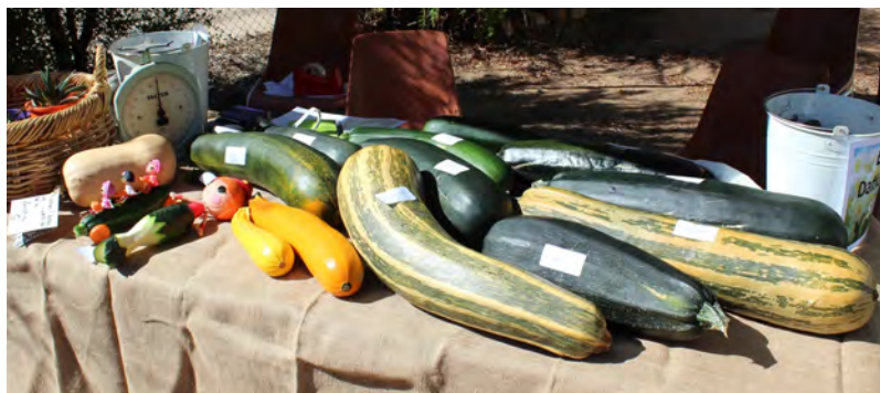
Above: Zucchini on display.

And yes this will be happening again next year so get ready to see if you can grow the biggest zucchini.