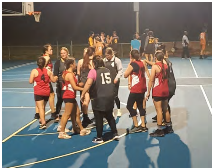
Above: Hot Shots and Bombettes shaking hands after their game.

Hoops I Did It Again 36 defeated Nothing But Fouls 31 Hot Shots 63 defeated Bombettes 28