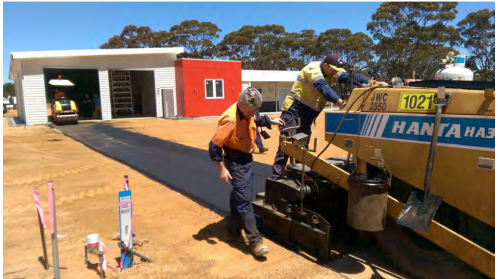
Asphalt being laid in front of new ambulance building.

Our contractor Greg Argent has finished the internal painting with the exception of the garage floor. The floor has to be made good by AK Homes prior to sealing and painting. Greg started painting the outside of the building this week and hopes to be finished by the end of the week. The main building will be painted shale grey (light grey) with white trim. And the highly recognisable red wall will get 2 more coats of paint before the watermark signage will be put into place.