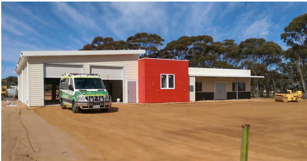
It's a trial run for the ambulance.

Just when you thought things could not get better, the RAC has joined in our donor list with a donation of $10,000 in support of the fatigue management rooms. The RAC was very keen to support the project, specifically the management of volunteer fatigue. It is