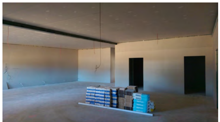
Below: Gyprock has been attached.