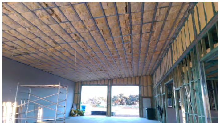
Above: Insulation has been installed in the Centre.