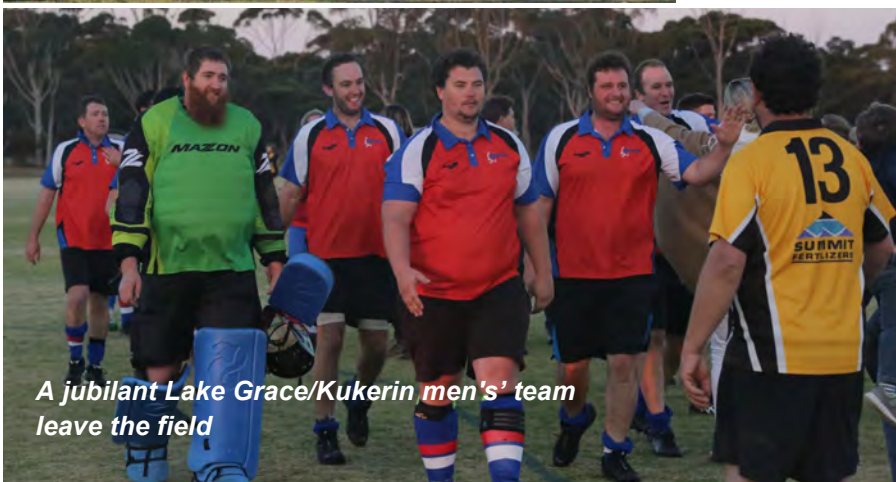
A jubilant Lake Grace/Kukerin men's' team leave the field