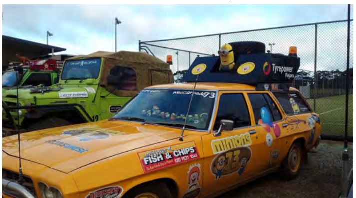
Minions on tour.