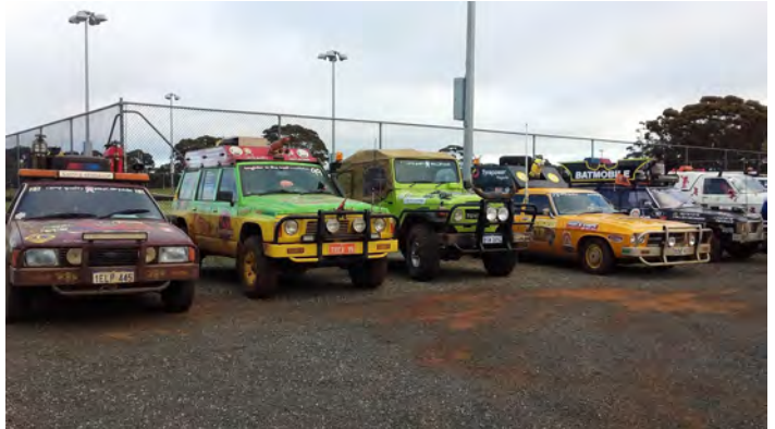
Above and Below: There was an assortment of themed vehicles taking part in wesCarpade.

There is a minimum of two people in the car (Driver and Co-Driver/Navigator) and a maximum of four people. As part of wesCarpade participants visit schools along the way to showcase their Primary School Education Program that answers difficult questions kids have about cancer.