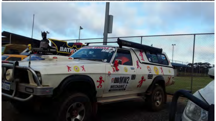
Flanked by the Batmobile Elmo appears to be the official mechanic.