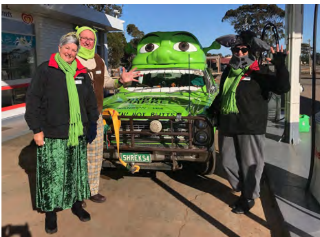
Princess Fiona, Shrek and Donkey fuelling up the 'Shrekmobile' at the Lake Grace Roadhouse.