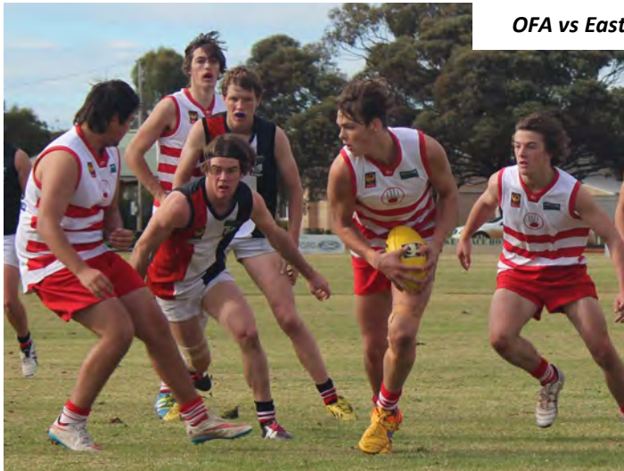
OFA vs Eastern Districts

very impressed with the LSW colts all weekend. At the final siren the LSW team prevailed having not been present at the carnival for some 15 years.