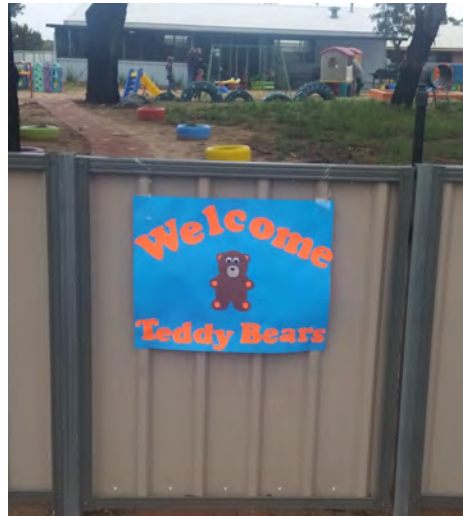
Teddy Bears welcome ↑

Whew! What a day! No wonder we, and our Teddies, had a lovely long afternoon nap after Playgroup that day!