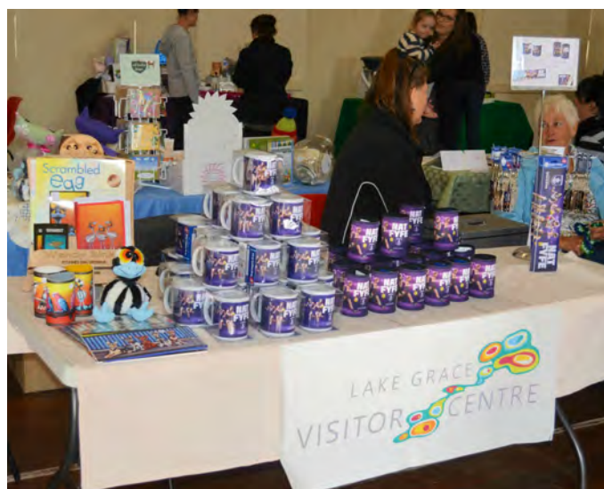
Nat Fyfe Launch on display for the Visitor Centre.