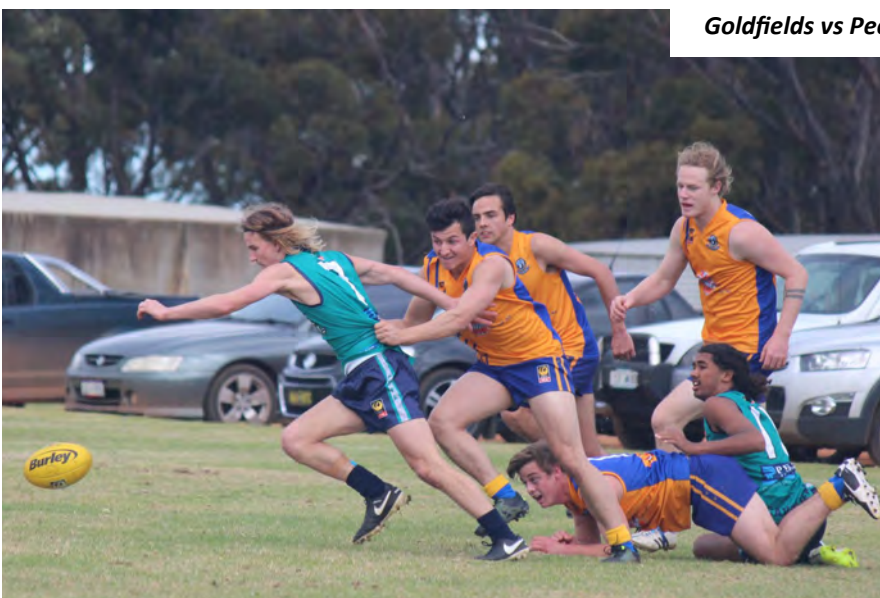
Goldfields vs Peel