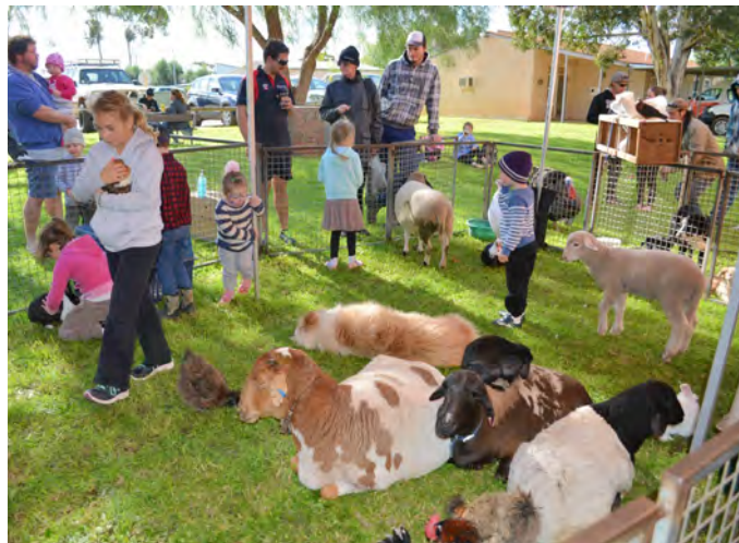
Incredible Creatures was a crowd favourite.

Overall the feedback I have received on the event has been very positive and I would like to send out a huge thankyou to those who volunteered their time assisting me with the organising of this event. Lets hope we can make this event larger and more entertaining next year.