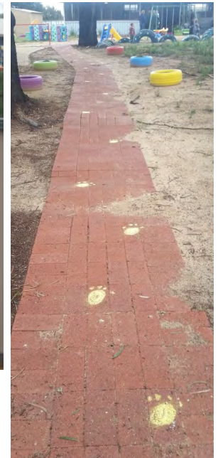
Teddy Bear footprints →