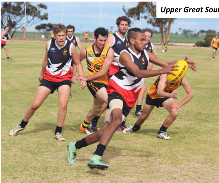
Upper Great Southern vs Esperance