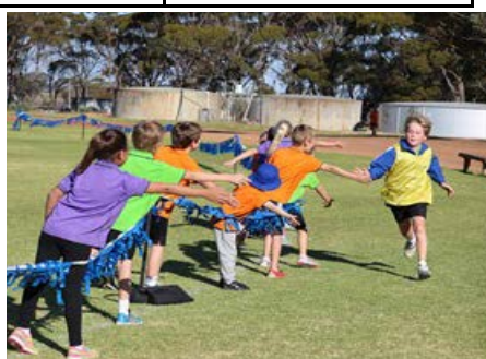
Right: a runner getting encouragement as he finishes the race.