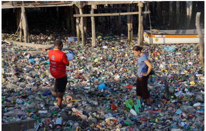
Ocean pollution choking parts of Port Moresby, PNG.