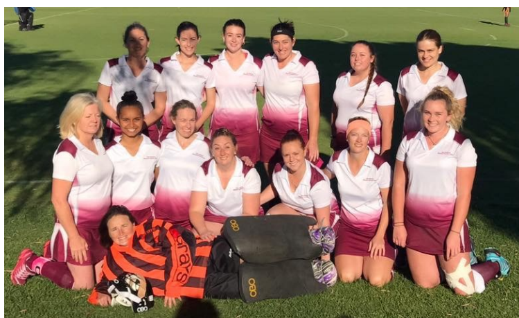
Above: the Roe Districts division three team.

This weekend's game is in Corrigin with the C grade starting at 11.15am. We'd love to see you there supporting us to finish off National Hockey week.