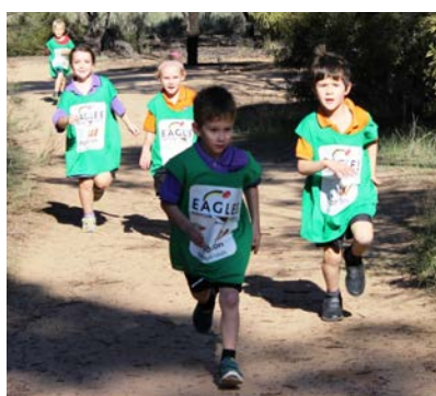
Left: some of the six year old boys and girls running in their 500m race.