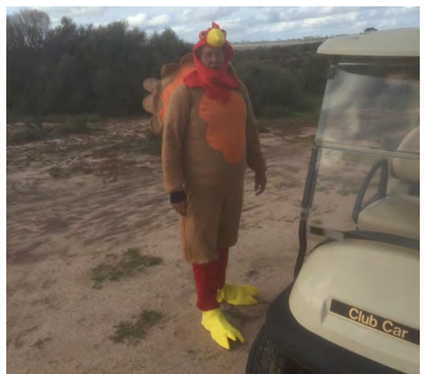
Not too much walking for the bush turkey as he travelled the course via buggy.