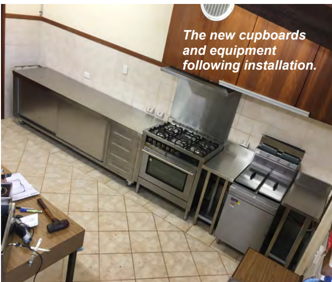
The new cupboards and equipment following installation.