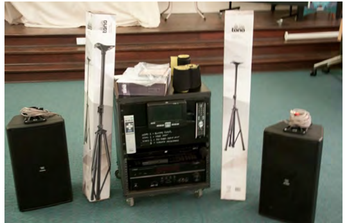
Above: The new compact equipment

The movie shown was The Hundred Foot Journey that is about two competing restaurants, one French restaurant, Madame Mallory's and across the road an Indian restaurant run by the Kadam family from Mumbai. Starring Helen Mirren and Om Puri the movie was a light hearted romantic story and was thoroughly enjoyed by all who attended.