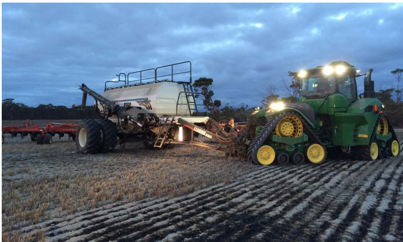
Photo: The John Deere 9570RX Tractor getting ready to go.

Over the weekend of the 11 th and 12 th of May the community crop was sowed to La Trobe barley. Although sowed into tough dry conditions it all went in nicely and timely as last week we received 28mls of rain to get it off to a very good start.